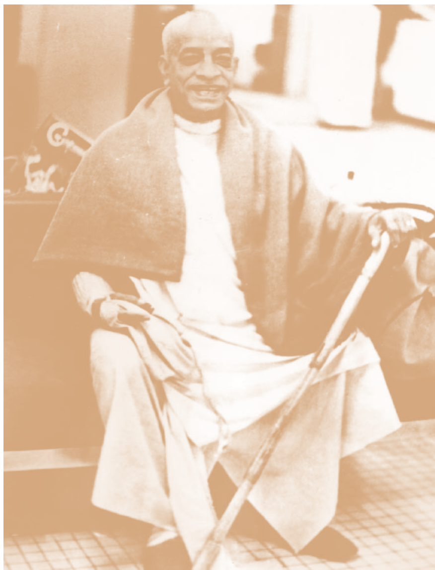
nitya-tīlā-praviṣṭa om viṣṇupāda Śrī Ścīmad Bhaktivedānta Svāmī Mahārāja